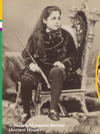
© Norfolk Museums Service (Ancient House)